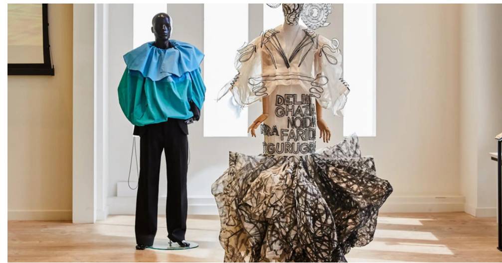
Fashion For Good